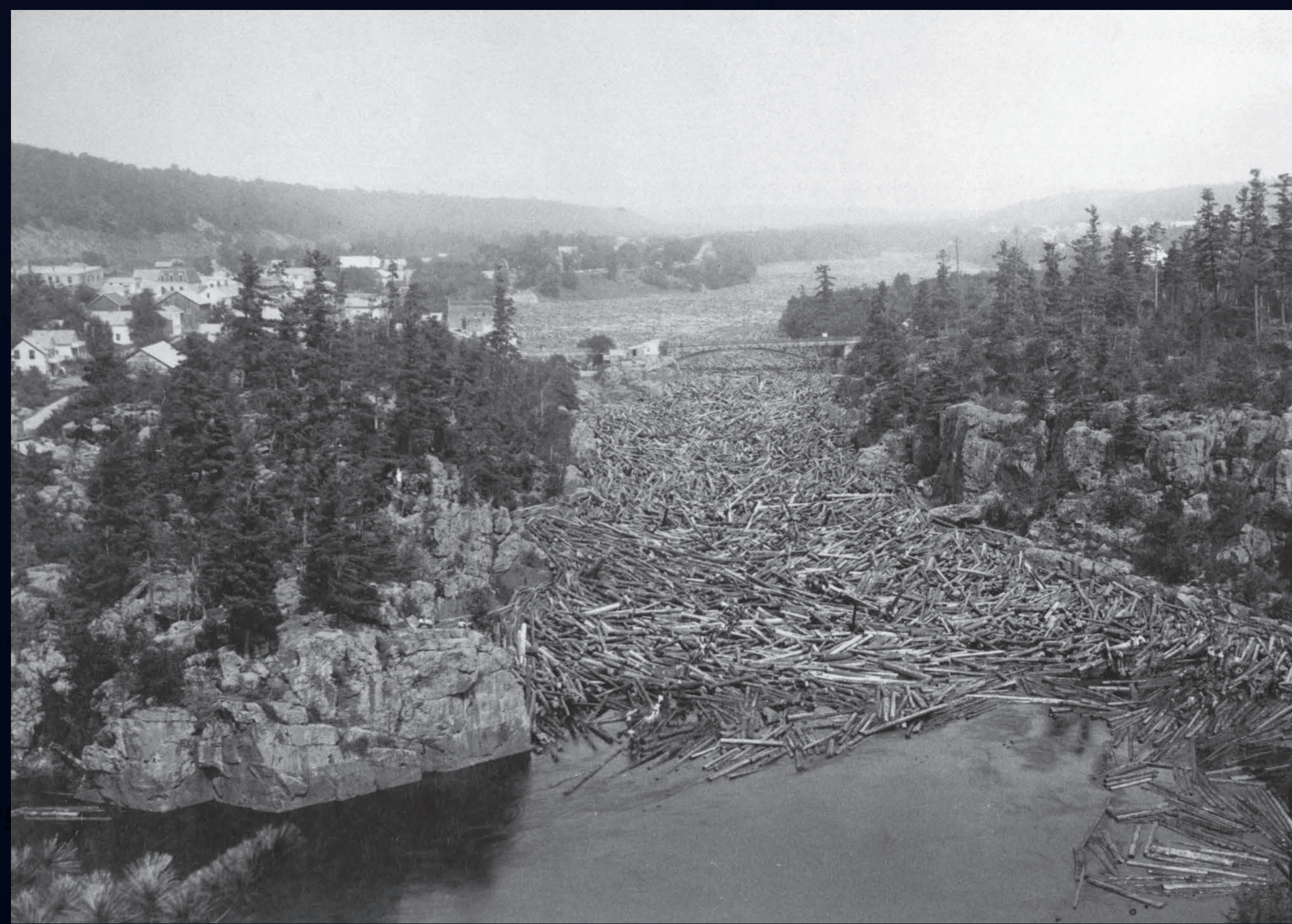
View looking down on log jam on the St. Croix River at Taylor Falls