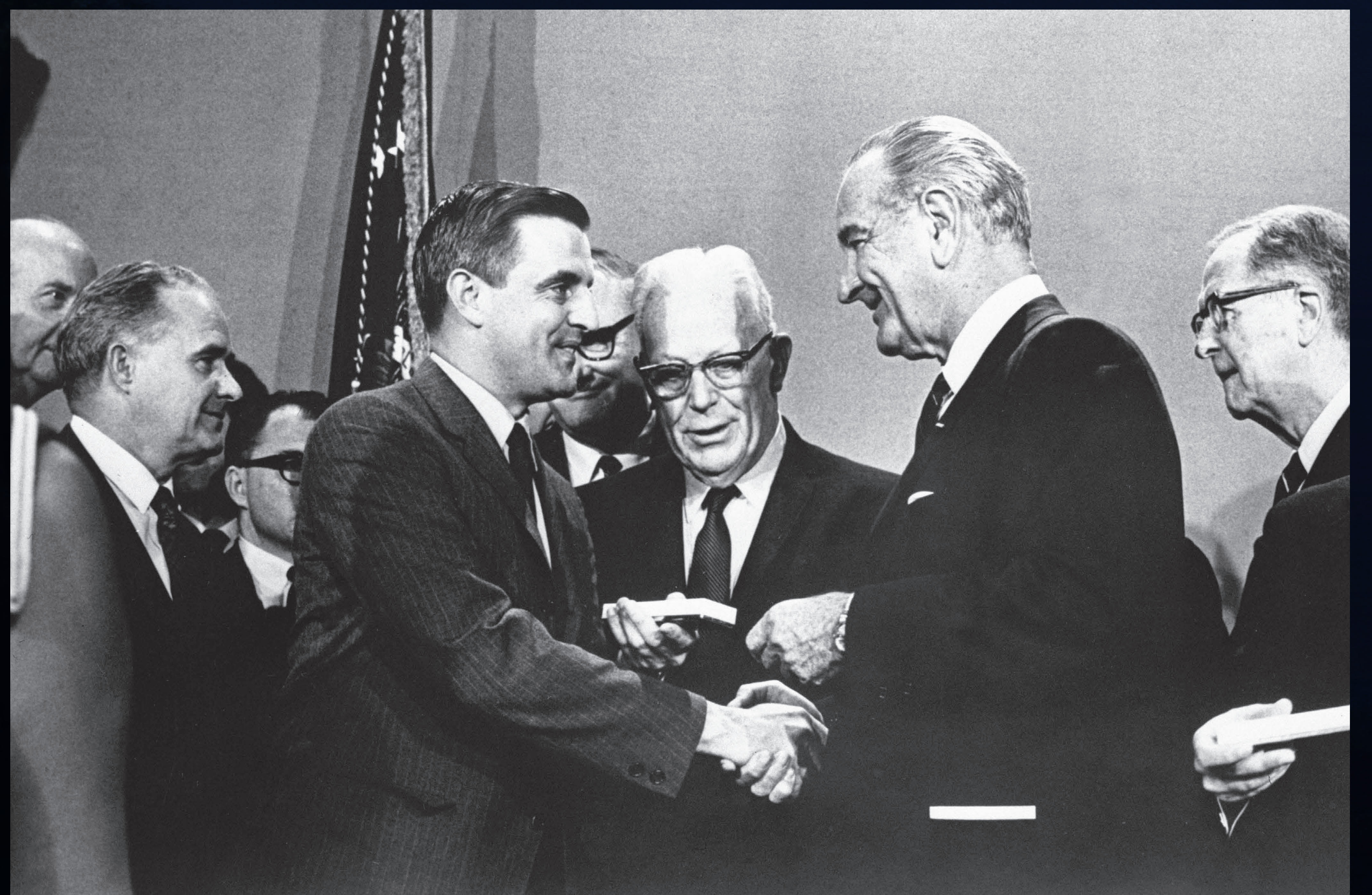
Minnesota Senator Walter Mondale receiving the pen President Johnson used to sign the Wild and Scenic Rivers Act.